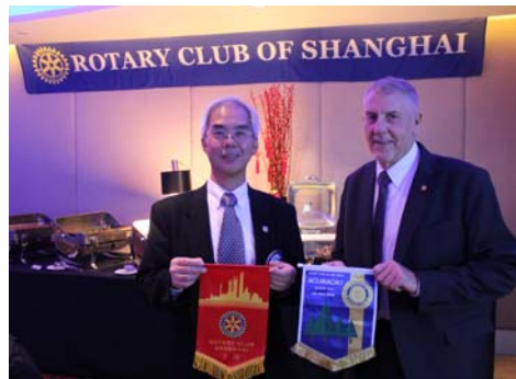
Banner Exchange with RC Aclimacao