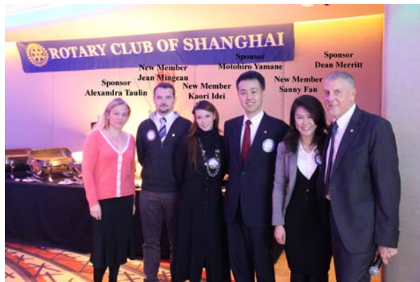
New inductees and sponsors